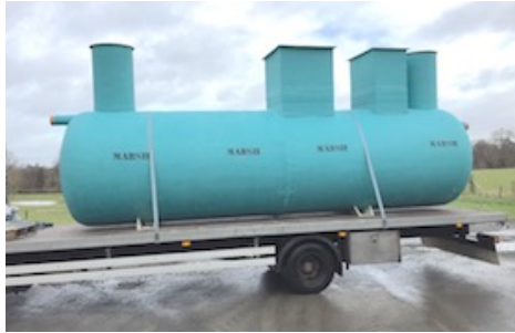
2. Take delivery of the tanks