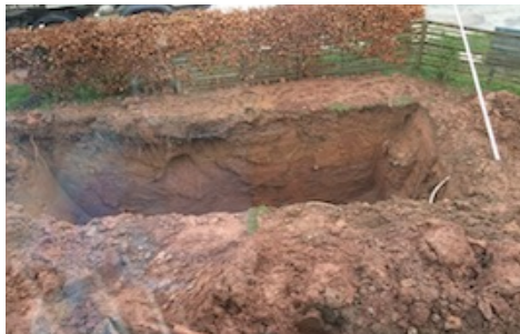
1. Dig a big hole in the front lawn

We installed a new sewage system. Here's how: