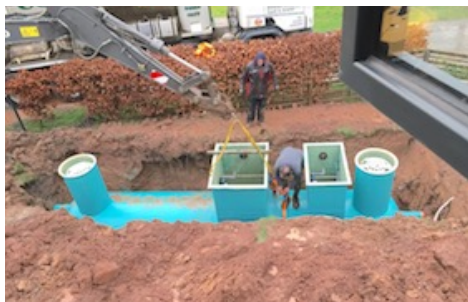
3. Lower the tanks into the hole