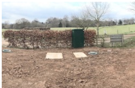
4. Fill in the hole