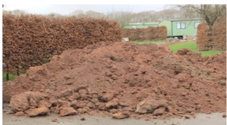
5. And finally, get rid of all that soil!

The total installation cost more than £25,000.