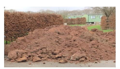
5. And finally, get rid of all that soil!