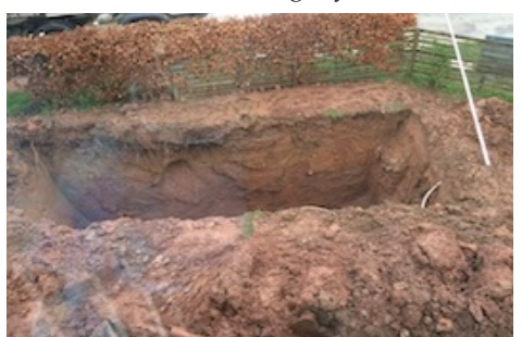
1. Dig a big hole in the front lawn

We installed a new sewage system. Here's how: