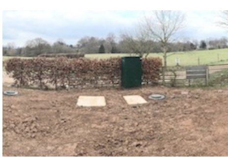
4. Fill in the hole

The total installation cost more than £25,000.