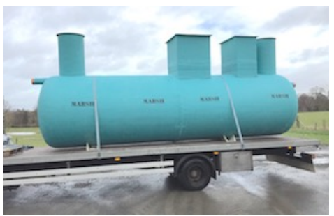
2. Take delivery of the tanks